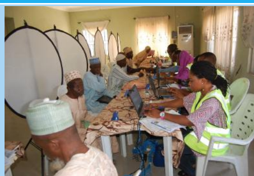
Bauchi Pensioners having their biometric data captured during the verification exercise.