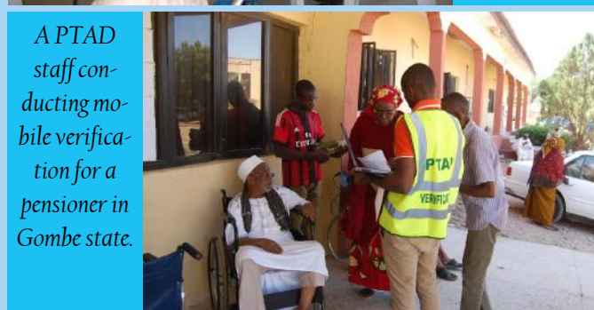
A PTAD staff conducting mobile verification for a pensioner in Gombe state.