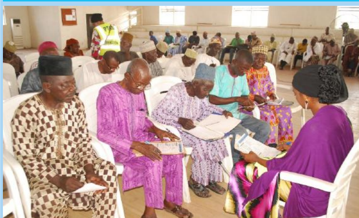
A PTAD staff assists Taraba pensioners to fill their verification forms