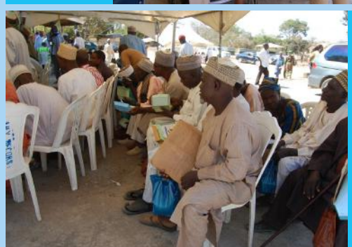
Pensioners in Bauchi comfortably waiting for their documents to be reviewed while enjoying a meal.