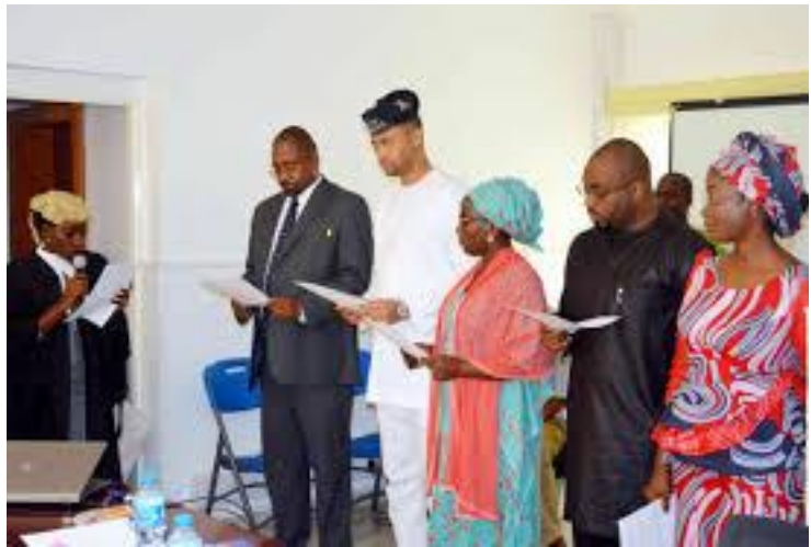
Members of Anti-Corruption and Transparency Unit of PTAD being inaugurated by the ICPC

The Directorate strives to fight against corruption and thus enforces needs every Staff to partake. Working together we can keep corruption out of PTAD and the Country, and flush out any corrupt individuals from our great nation!!